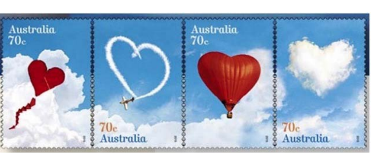
Australia Strip of 4, #4249a

It is odd that for all the love, the day or what inspired it is never mentioned or depicted in the US program.