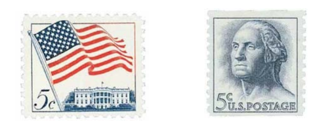
#1208 Flag Over White House & #1229 George Washington

From Liberty Series #1036 Abraham Lincoln & #1038 James Monroe